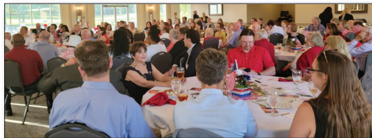
Great crowd of over 100 !